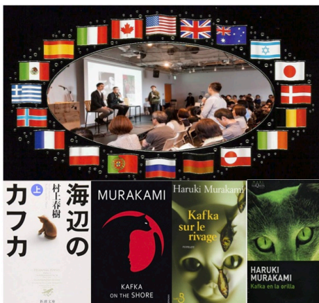
⑤ At a gathering of Murakami translators