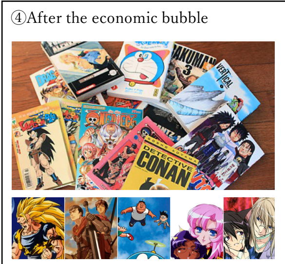
④ After the economic bubble