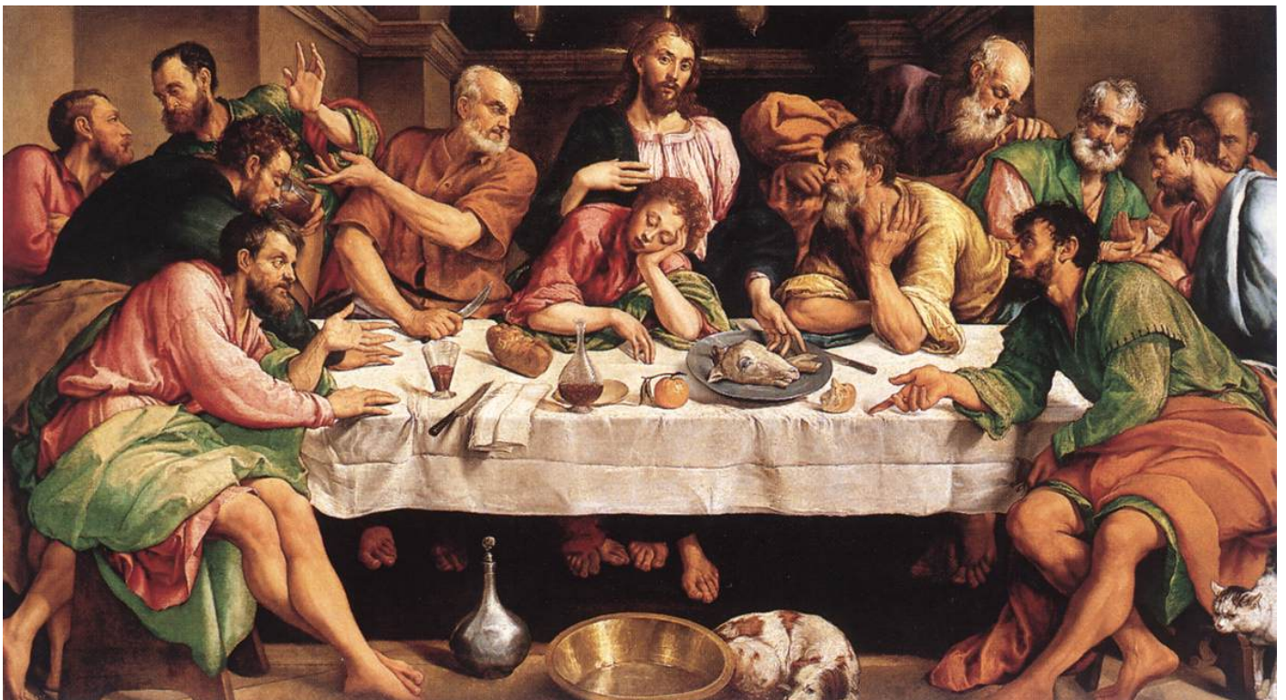
(Jacopo Bassano, 1542)